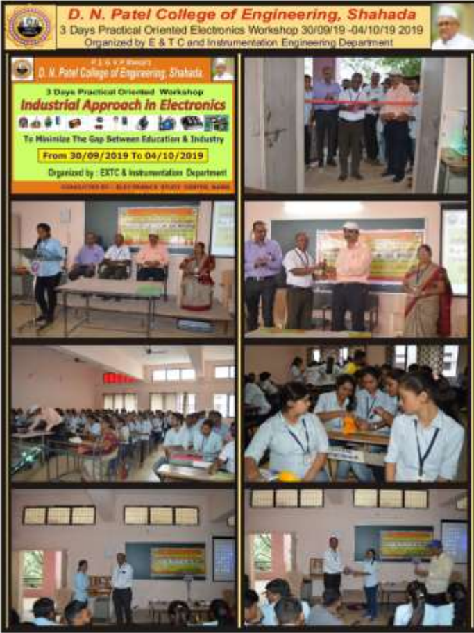
Workshop on Industrial Approach in Electronics