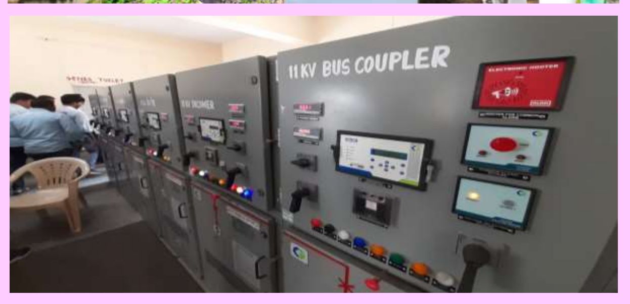
INDUSTRIAL VISIT NO-1 AT 33/11KV SHAHADA URBAN SUBSTAION AND 33/11KV GIS