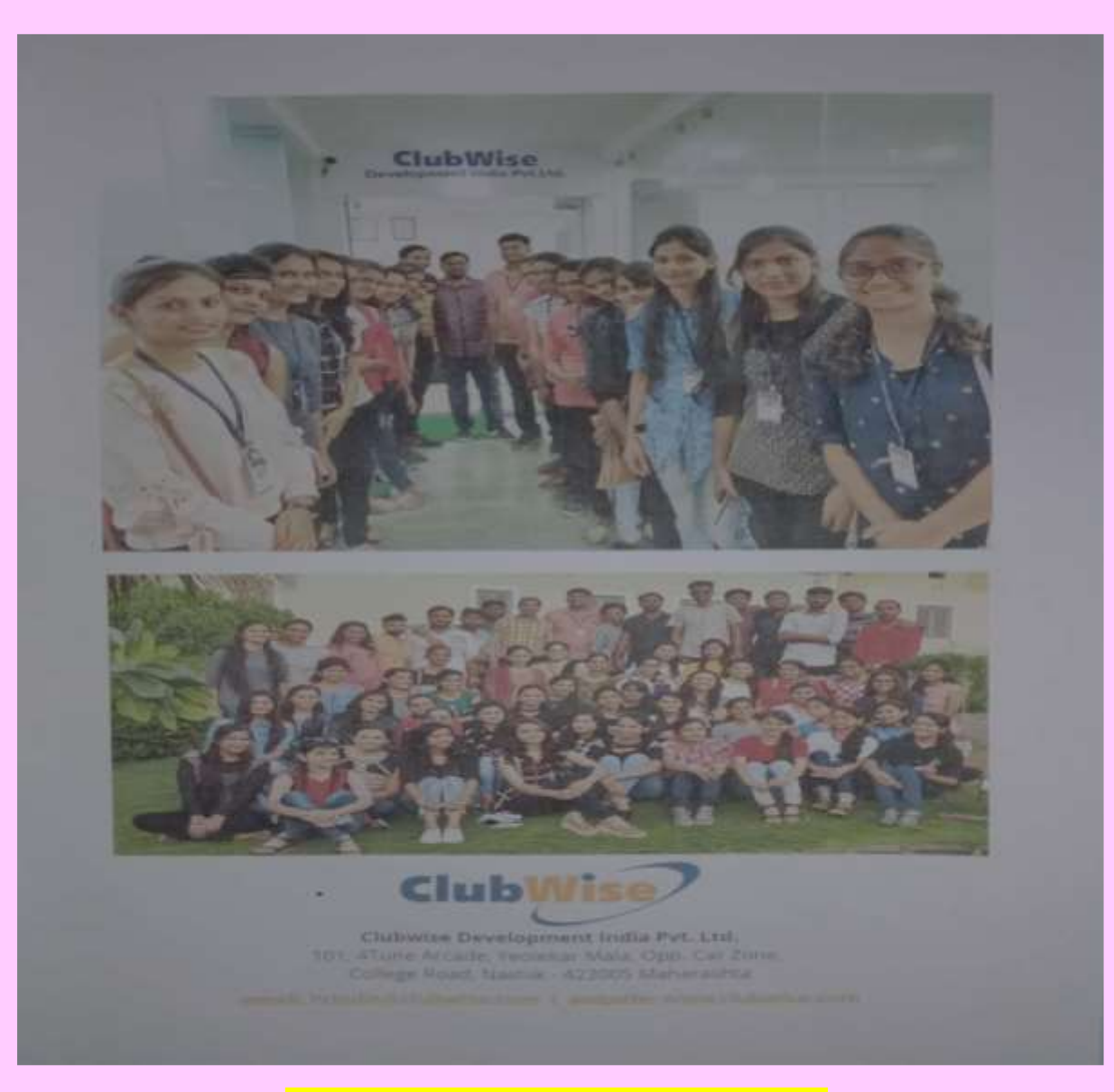
Clubwise Development India Pvt Ltd.