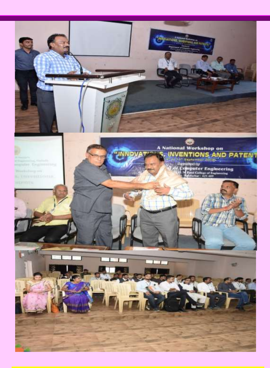
Workshop on "INNOVATIONS, INVENTIONS, AND PATENTS"