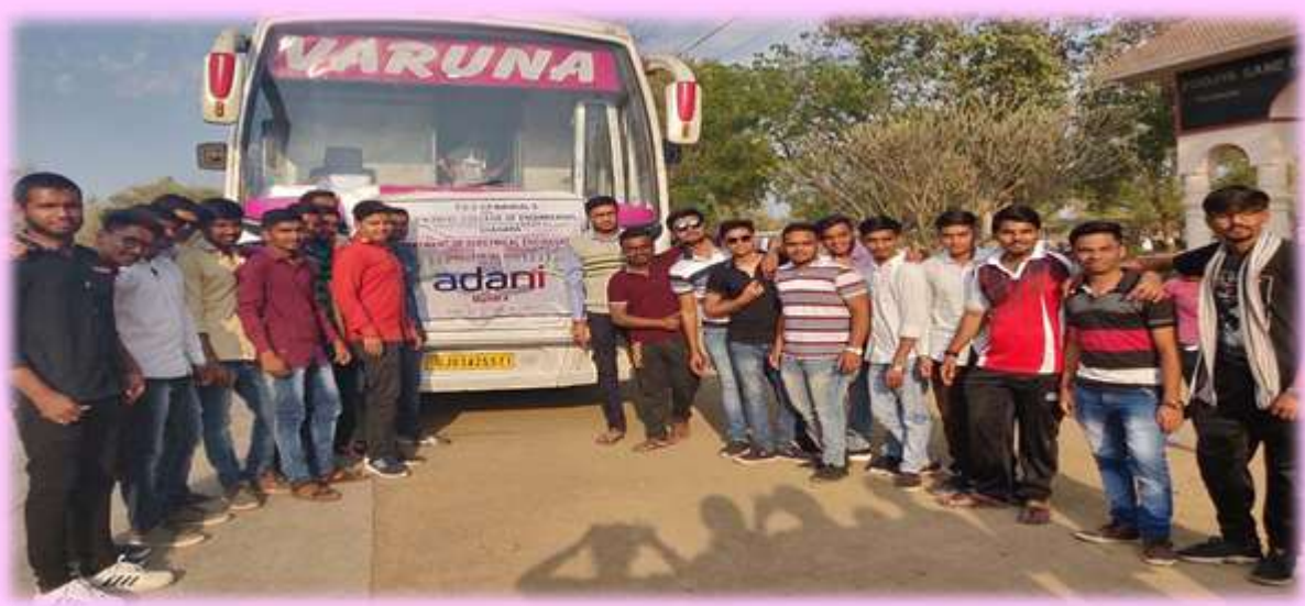
Industrial Visit at Adani, Mundra