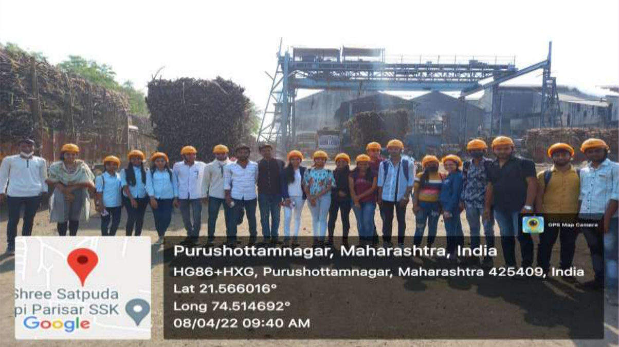
Process Instrumentation study at Distillery Unit of SSTPSSK, Purushottamnagar