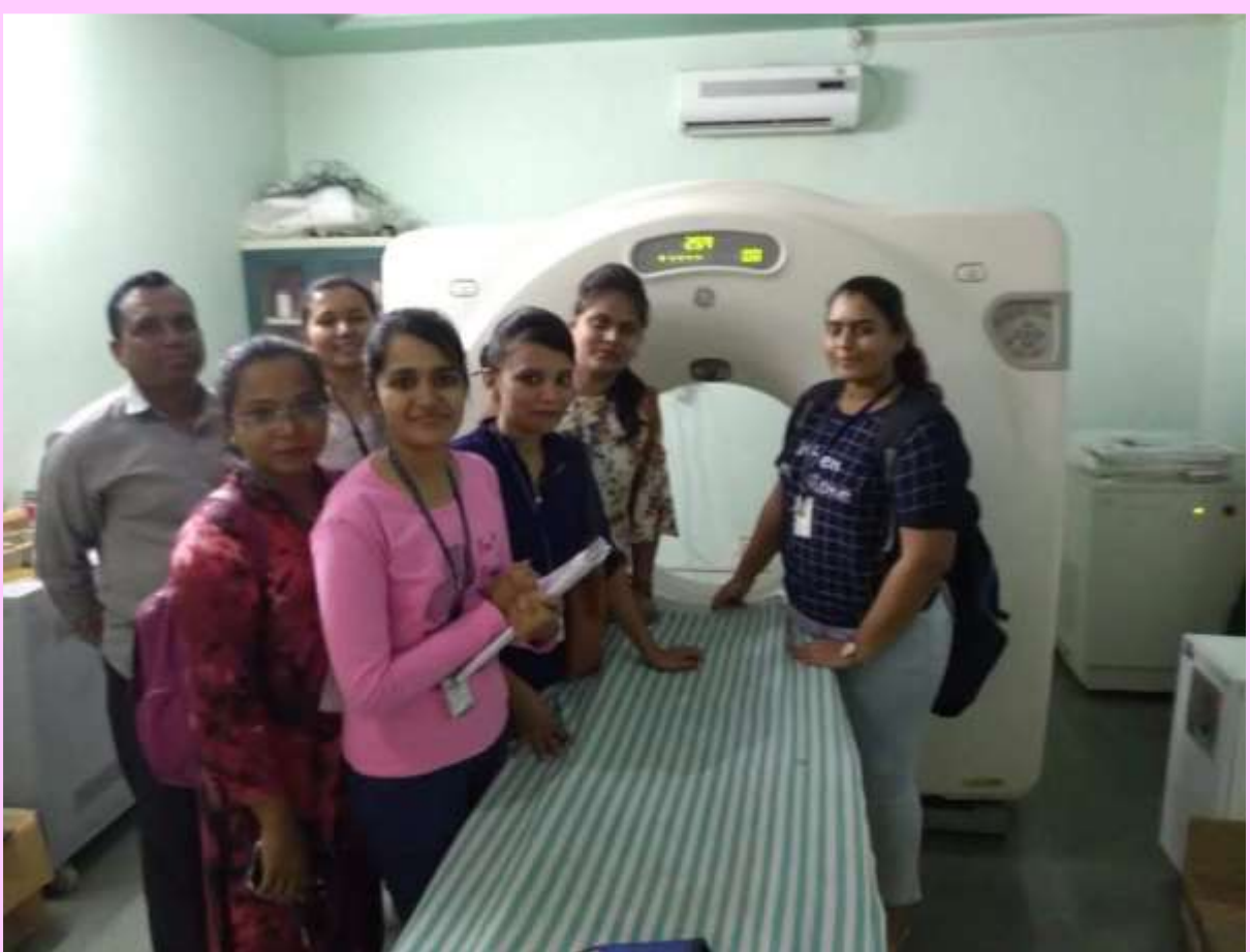
Biomedical study at Shushrut Hospital, Shahada