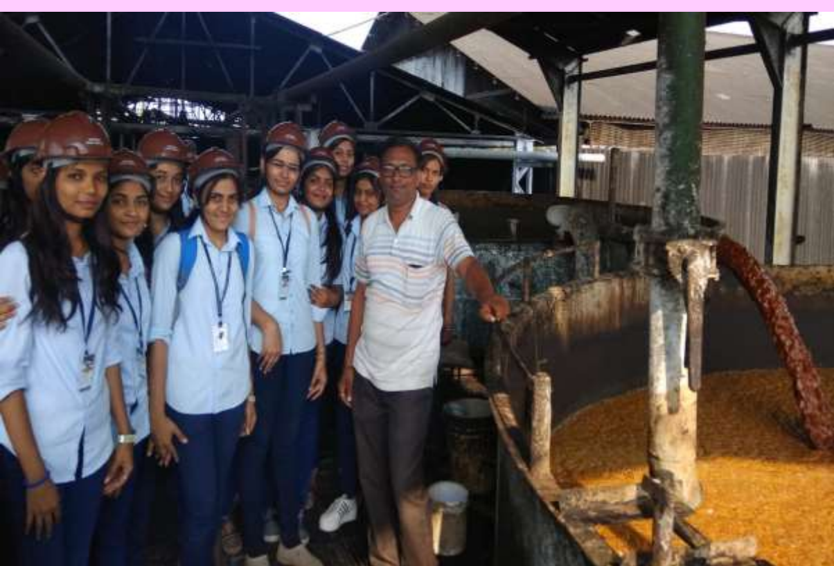
Study Tour at Distillery Plant, SSTPSSK P. Nagar by Instrumentation Department