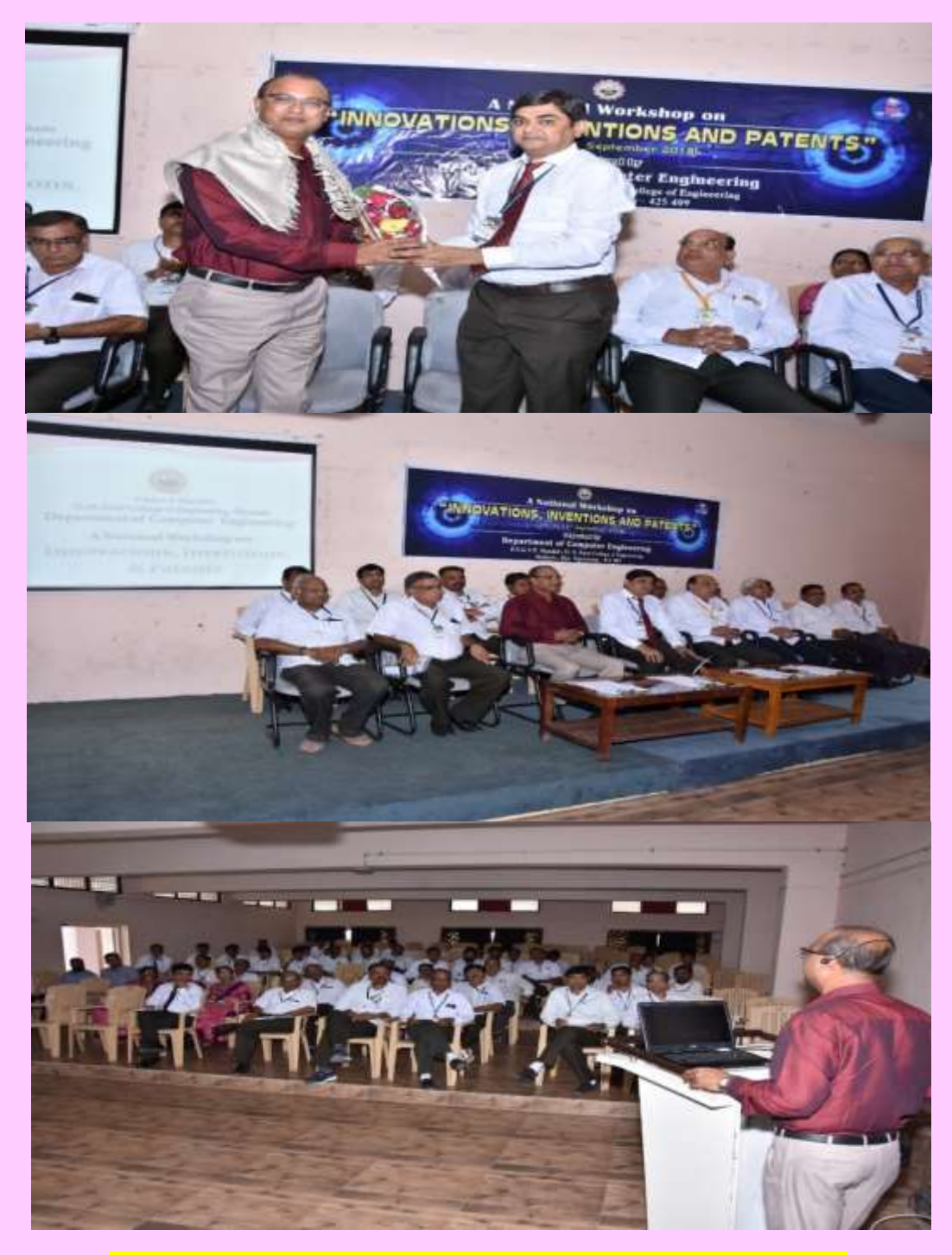
Workshop on "Innovations, Inventions, And Patents"