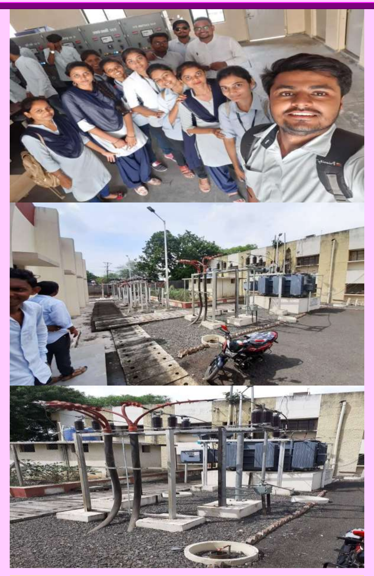
INDUSTRIAL VISIT NO-1 AT 33/11KV SHAHADA URBAN SUBSTAION AND 33/11KV GIS