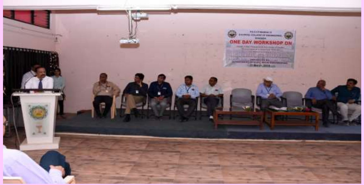
National Safety Council- Maharashtra ChapterElectrical Safety