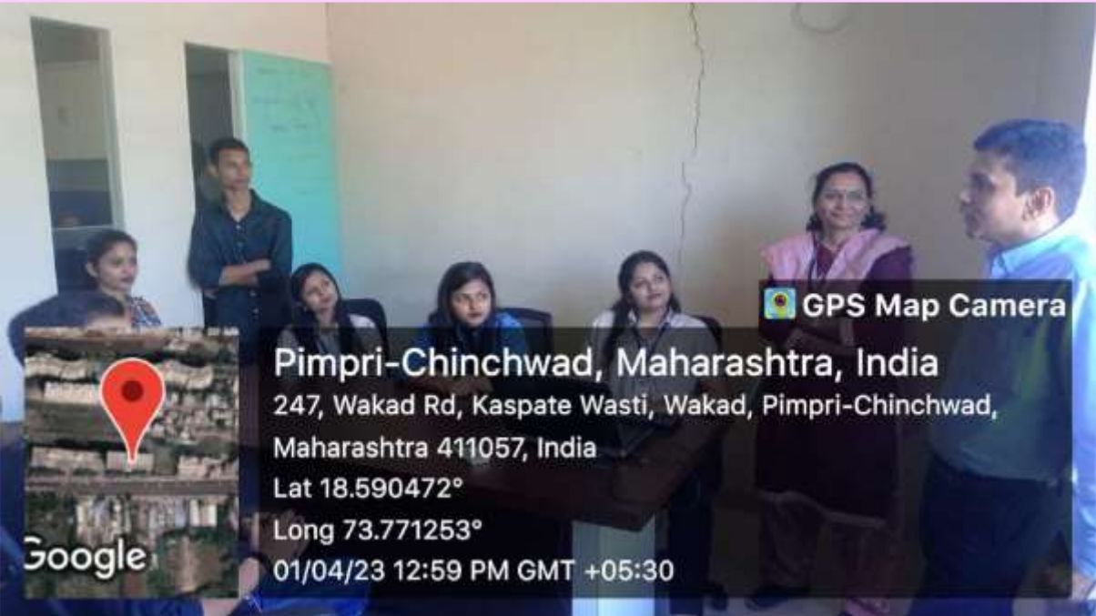
Industrial Visit at Disha Technologies PVT LTD, Wakad, Pune