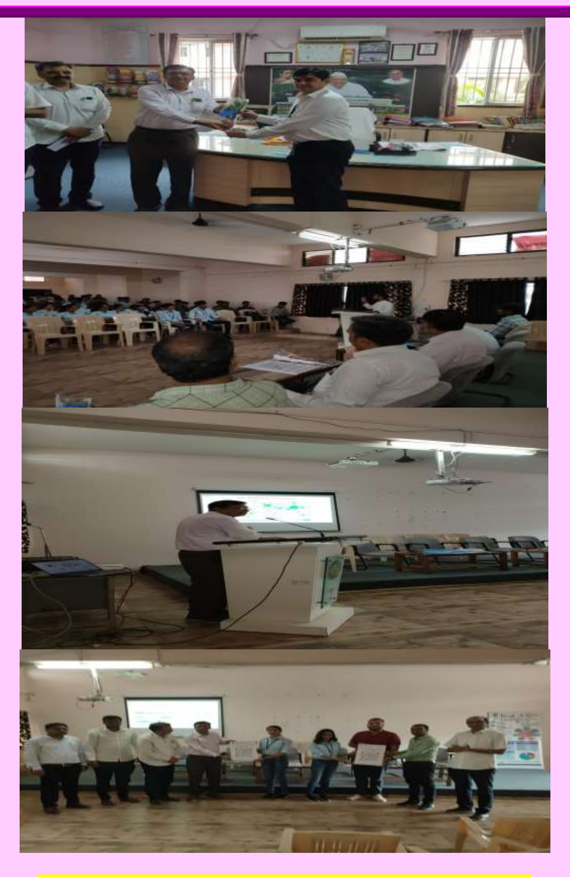
Entrepreneurship Development by KCiil, KBCNMU, Jalgoan