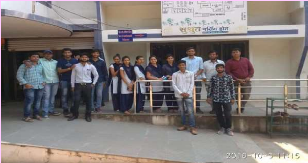
Biomedical Instrumentation study tour at Shushrut Hospital, Shahada