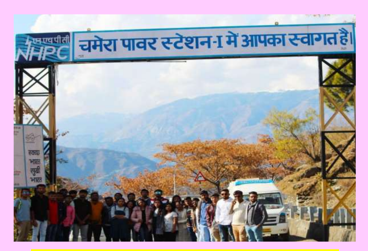
Industrial Visit NHPC Chamera Power Station-I Himachal Pradesh